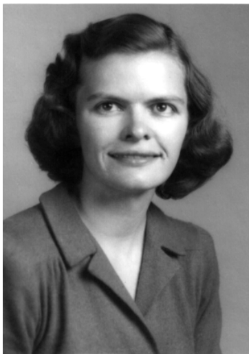
Fig. D.4: Julia Robinson

Robinson was depressed for a long time, but eventually decided to continue studying mathematics. She returned to Berkeley and completed her PhD in 1948 under the supervision of Alfred Tarski. The first-order theory of the real numbers had been shown to be decidable by Tarski, and from Gödel's work it followed that the first-order theory of the natural numbers is undecidable. It was a major open problem whether the first-order theory of the rationals is decidable or not. In her thesis (1949), Robinson proved that it was not.