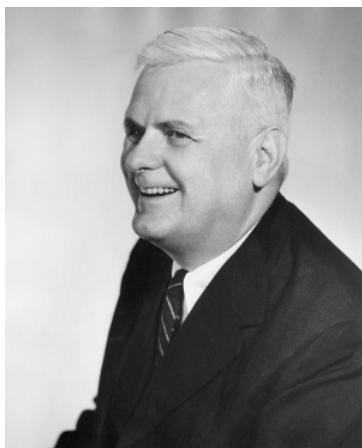
Fig. D.1: Alonzo Church

Alonzo Church was born in Washington, DC on June 14, 1903. In early childhood, an air gun incident left Church blind in one eye. He finished preparatory school in Connecticut in 1920 and began his university education at Princeton that same year. He completed his doctoral studies in 1927. After a couple years abroad, Church returned to Princeton. Church was known to be exceedingly polite and careful. His blackboard writing was immaculate, and he would preserve important papers by carefully covering them in Duco cement (a clear glue). Outside of his academic pursuits, he enjoyed reading science fiction magazines and was not afraid to write to the editors if he spotted any inaccuracies in the writing.