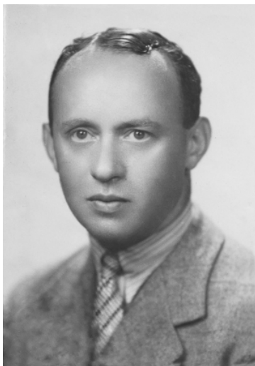
Fig. D.5: Alfred Tarski

Before emigrating to the United States in 1939, Tarski completed some of his most important work while working as a secondary school teacher in Warsaw. His work on logical consequence and logical truth were written during this time. In 1939, Tarski was visiting the United States for a lecture tour. During his visit, Germany invaded Poland, and because of his Jewish heritage, Tarski could not return. His wife and children remained in Poland until the end of the war, but were then able to emigrate to the United States as well. Tarski taught at Harvard, the College of the City of New York, and the Institute for Advanced Study at Princeton, and finally the University of California, Berkeley.